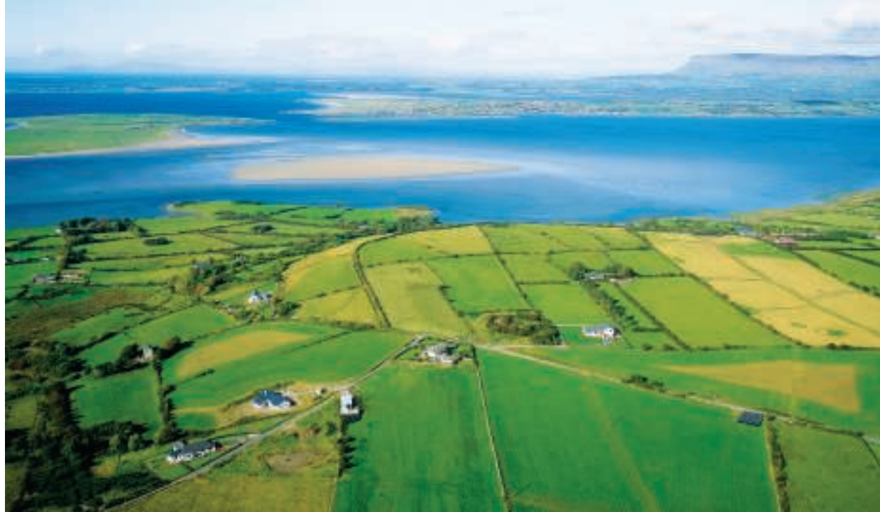
The view across the Irish countryside and Sligo Bay to Rosses Point

Despite the incursions of the English, these countries retain their own distinctive character, as well as being blessed with dramatic scenery and warm-hearted people.