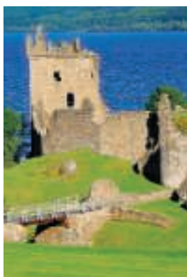
Urquhart Castle on the shores of Loch Ness 58

DAY 14 – EDINBURGH. Departure transfers arrive at Edinburgh Airport at 06:15 & 09:00. (B)