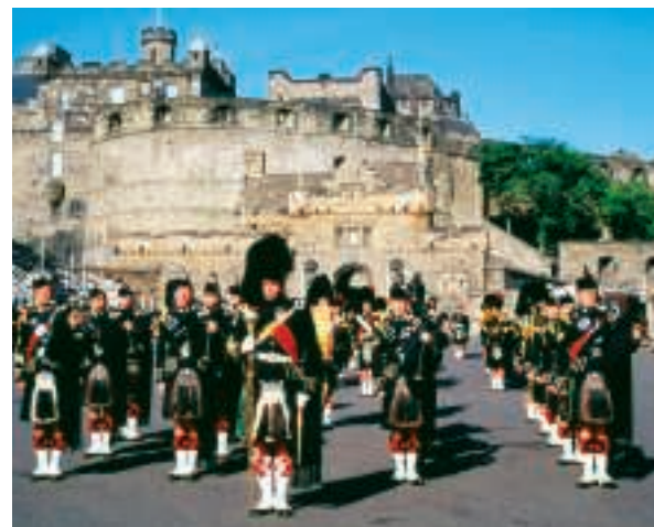
Every August, Edinburgh Castle hosts the spectacular Military Tattoo